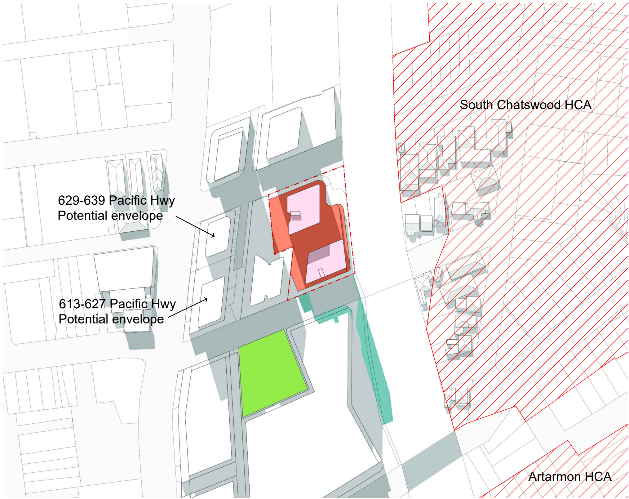
1PM (21 JUNE)